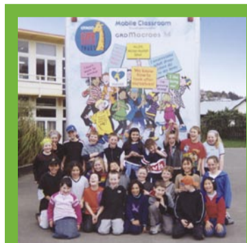
Caversham School students were some of 8,000 Otago students who experienced a life education lesson in the Life Education Trust's mobile classroom last year. The Community Trust of Otago has contributed to major upgrades of the mobile classrooms and to annual programme costs.

The Trust is also supporting the programme in 2006.