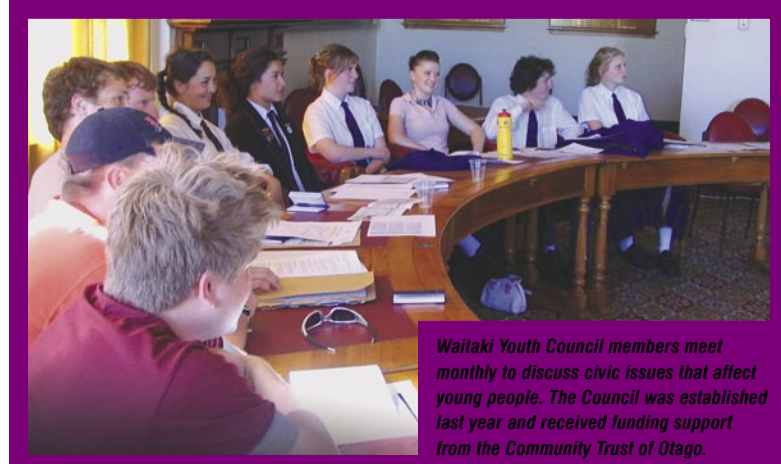
Waitaki Youth Council members meet monthly to discuss civic issues that affect young people. The Council was established last year and received funding support from the Community Trust of Otago.

Located on the outskirts of Lawrence, the town's position at the gateway to the Central Otago goldfields makes it one of New Zealand's most important and varied early Chinese settlements.