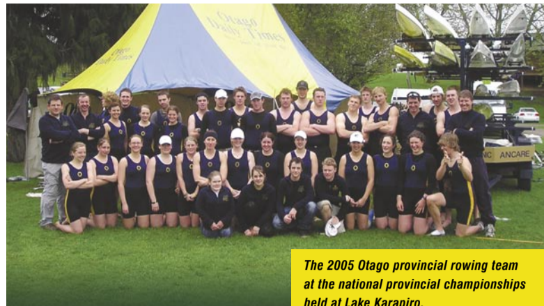
The 2005 Otago provincial rowing team at the national provincial championships held at Lake Karapiro.