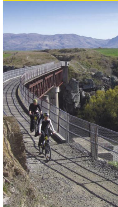
Rail trail cyclists crossing the Manuherikia No 1 Bridge at the start of the Poolburn Gorge.