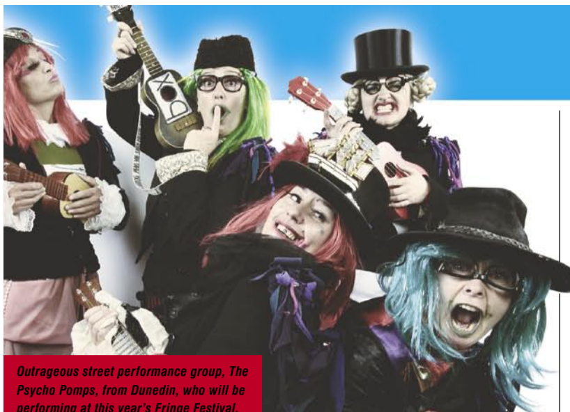
Outrageous street performance group, The Psycho Poms , from Dunedin, who will be performing at this year's Fringe Festival.