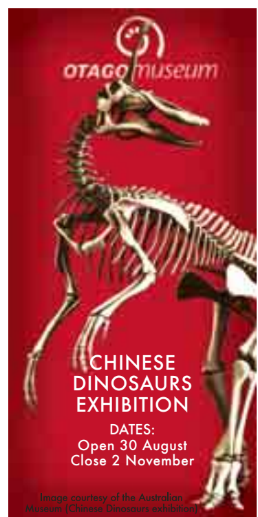
Otago Museum- Chinese Dinosaurs Exhibition $100,000

In addition the Trustees approved a further 320 donations ranging in value from $200 to $100,000.